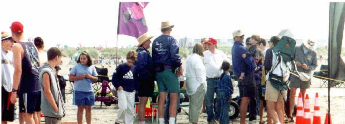
The WSIKF 2000 buggy ride line is a long one filled with both young and old!